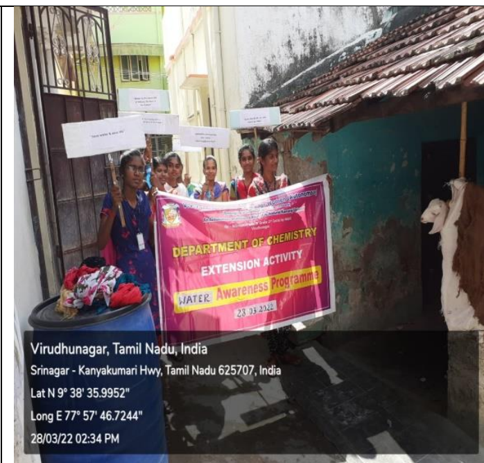
An awareness rally on use of drinking water source in Chathrareddyapatti on 28.03.2022