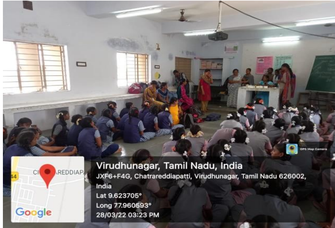
Awareness Programme on Anaemia among Adolescent Girls on 28.03.2022