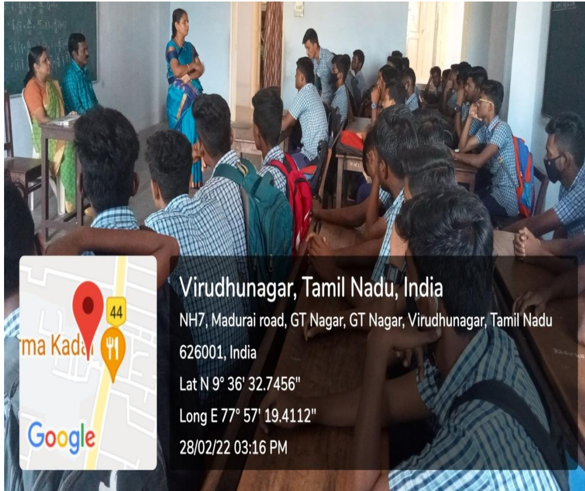
Outreach Activity on “Experimental Physics” to the XII standard students, Government Boys Higher Secondary School, Pandalgudi, Aruppukkottai