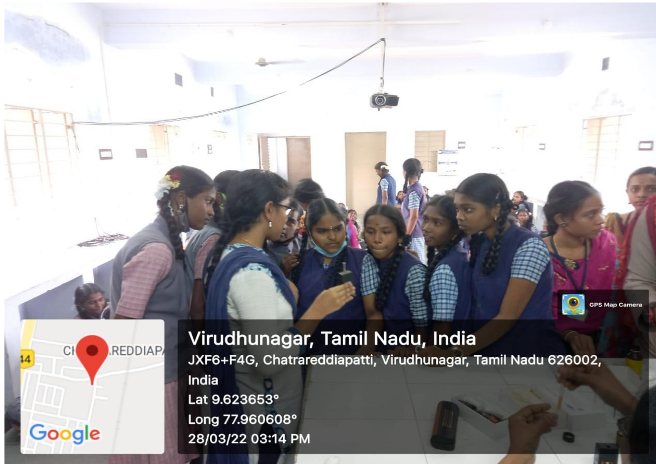
Our students Demonstrates on Estimation of Haemoglobin using Shali's Apparatus