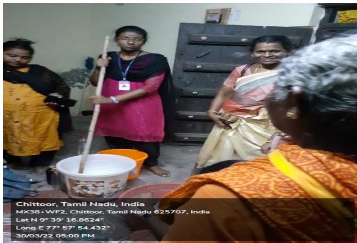
Training Programme on “phenoyl preparation” on 30.03.2022