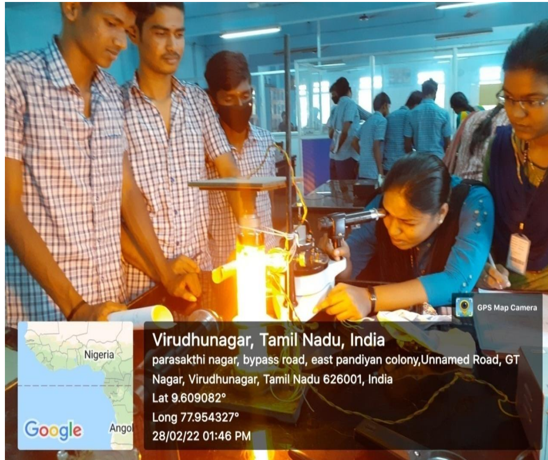
Outreach Activity on “Experimental Physics” to the XII standard students, Government Boys Higher Secondary School, Pandalgudi, Aruppukkottai