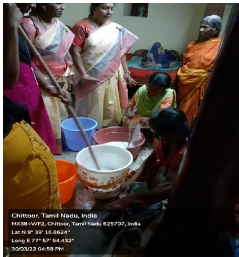
Demonstration on the preparation process of Phenyl, Soap oil and house hold items and distributed to women folk in the adopted village Chathrareddyapatti,